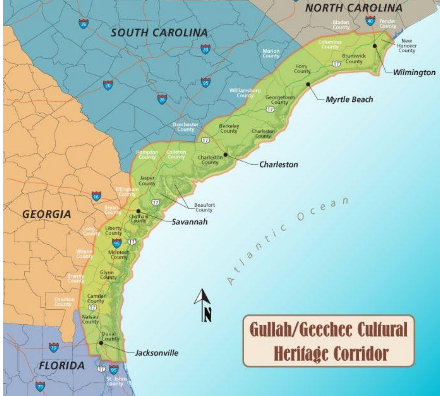
Gullah/Geechee Cultural Heritage Corridor